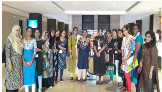
SSO Students attending CME