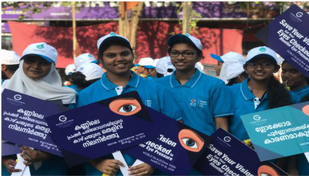
Glaucoma Week 2019